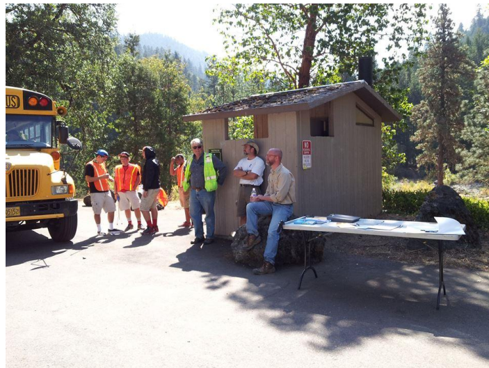
Cleanup at Island Creek

The park would like to start a small museum so we most likely will be invited back in 2015 to search a few other locations for artifacts. Mildred Kanipe is County park on the historical registry. Metal detecting is allowed. Anything you find you MUST turn in to the caretaker who resides in an RV over by Mildred’s home.