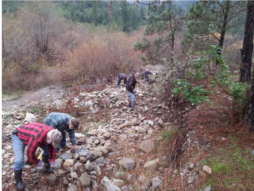
Reclamation work is a team effort!

On September 12, the BLM, DCPA and Riddle High School students met at the Island Creek Day Use Area for some clean up in conjunction with National Public Lands Day. There were 10 DCPA members in attendance. The BLM is thinking about closing Island Creek to drive in traffic. Their complaints are trash, crime and the environmental impact from mining. That day the focus was on picking up trash. We were fed lunch from Subway and given a T-Shirt. BLM supplied loaner pick up tools, gloves, safety vests and trash bags.