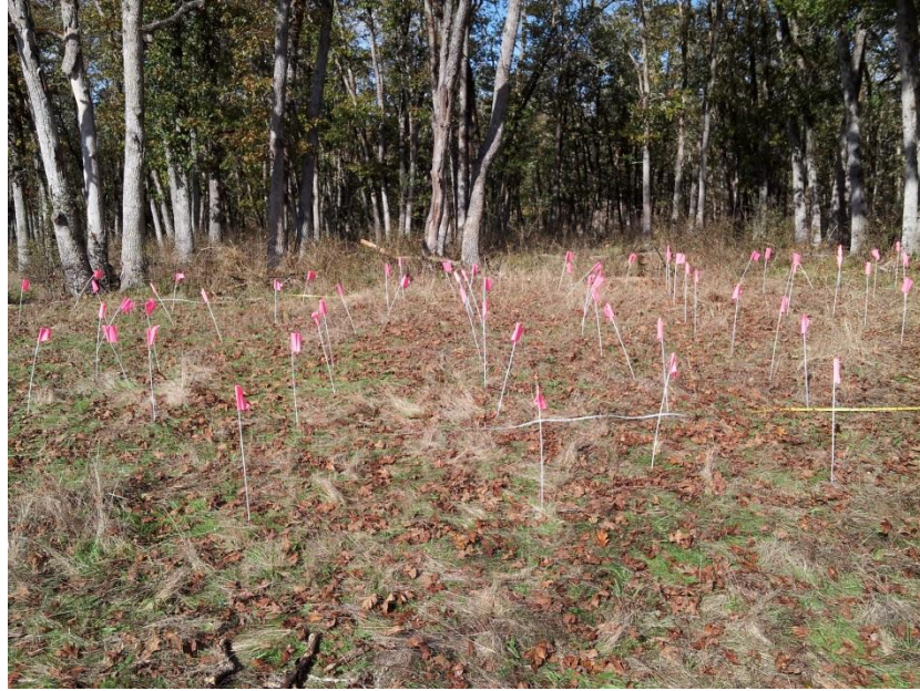
Flags mark metal target “hits”